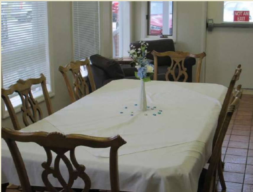
Residents and families at HSL can now enjoy a new dining area.