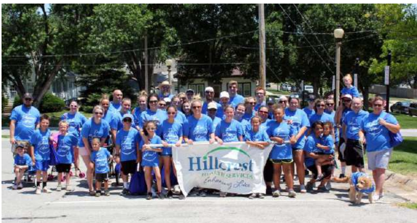
Team members and their family members take a group photo before walking in the Papillion Days Parade.

Around 50 team members and family members endured the heat on Saturday to represent Hillcrest in the annual Papillion Days Parade. This year, we specifically highlighted Hillcrest Country Estates Cottages and Grand Lodge, Hillcrest Shadow Lake, Hillcrest Home Care, Hillcrest Caring Companions and Hillcrest Hospice Care.