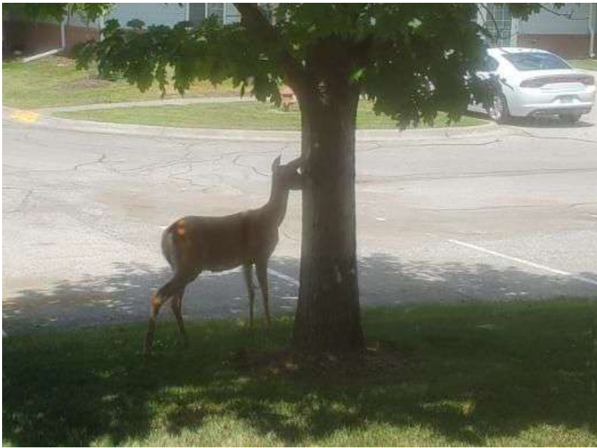
TMD's new furry friend hangs around a tree outside of the TMD Office.