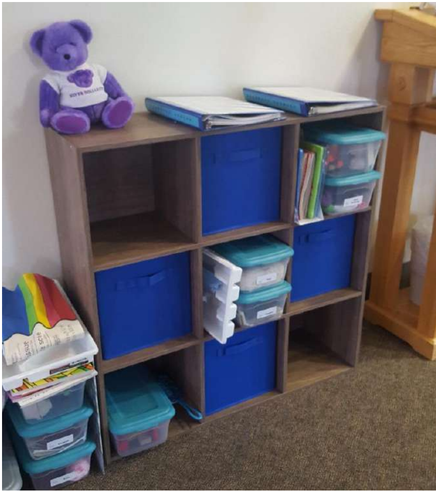
Pictured are the new activity cubbies.