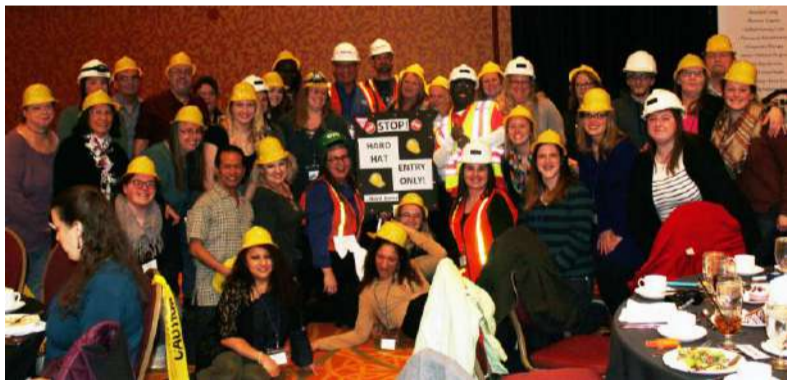
Some of the Hillcrest Shadow Lake crew poses with their sign and hats.

At the event, team members were able to network with others and get to know new team members. This was an especially timely opportunity to meet the team from Silver Ridge. Many of the service lines designed signs this year, which their teams proudly waved and raised overhead before the event began. The Hillcrest Shadow Lake team even had caution tape, lights, cones, noisemakers and hard hats to differentiate their "crew," a perfect theme since their building is currently undergoing renovations.