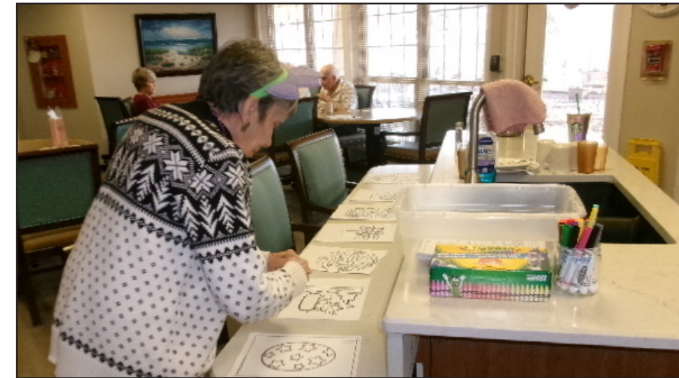
Residents prep for some spring-themed card making.