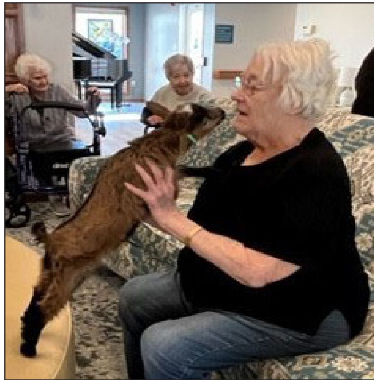
A curious baby goat visits us from Scatter Joy Acres.