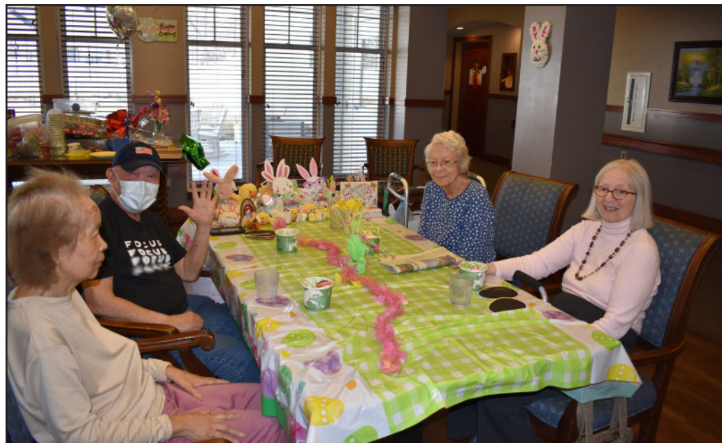
This crafty table really enjoys using their creativity to help celebrate Easter.