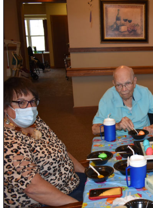
It's a good day for coloring eggs!