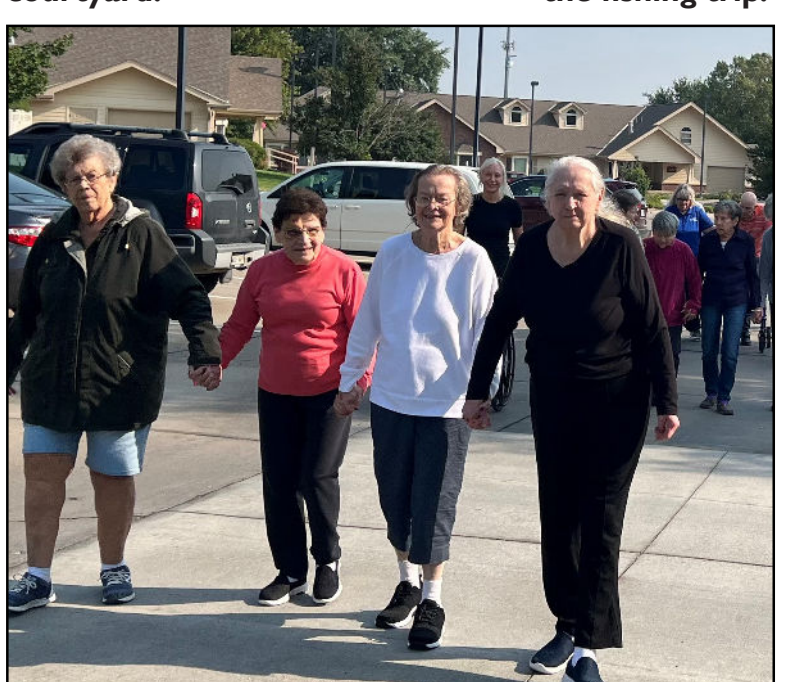
Residents get exercise by walking in the parking lot.