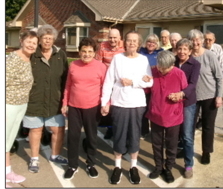
Members of the walking club pose for a photo.