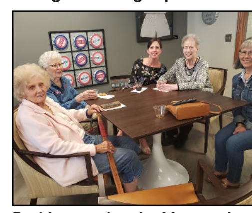
Residents enjoy the Meet and Greet with family.