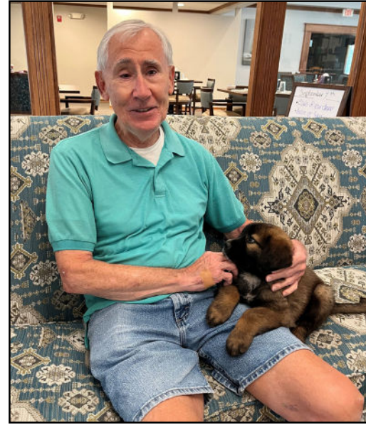
Butch cuddles a puppy from Scatter Joy Acres.