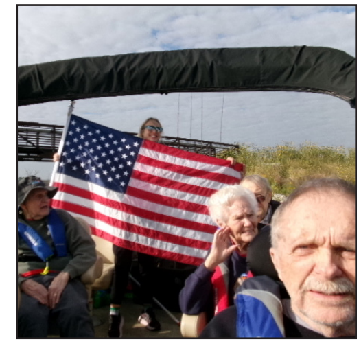
Residents enjoy the scenery on the boat.