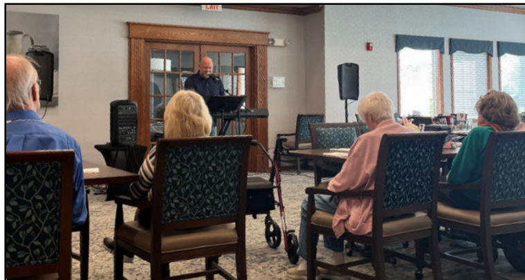
Jimmy Barnes performs for residents.