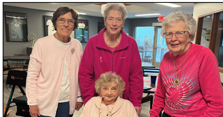
Residents dress in pink for breast cancer awareness.