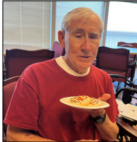
Butch is ready to eat his Halloween cookies.