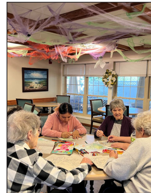
Residents get together to color Halloween pictures.