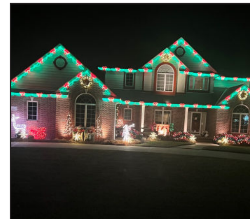
Holiday lights tours are always a favorite outing.