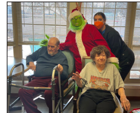
The Grinch visits Connor House.