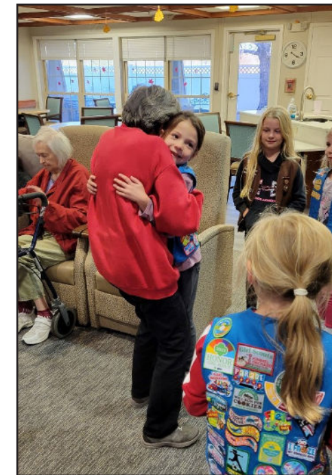
Carroll hugs a Daisy Girl Scout.