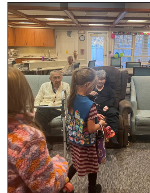
Residents receive a visit from the Daisy Girl Scouts.