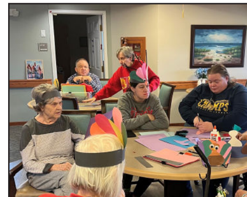
Residents make turkey hats with Hands of Heartland.