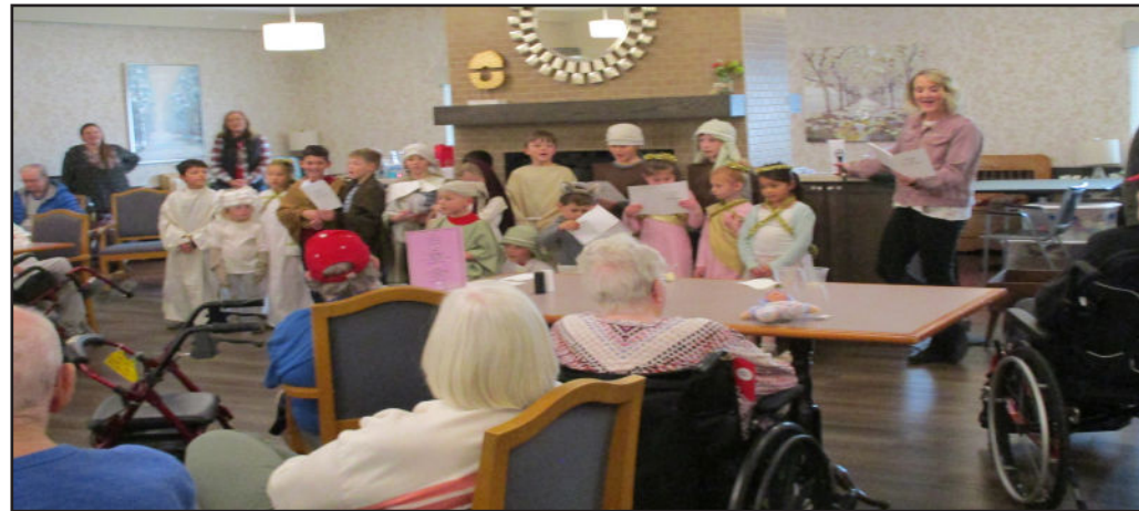
The Blossom Homeschool group performs for residents.