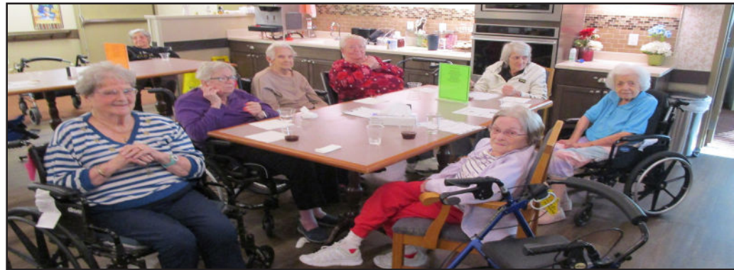
Residents socialize during happy hour.