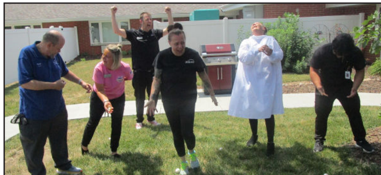
Team members participate in a game of egg roulette.