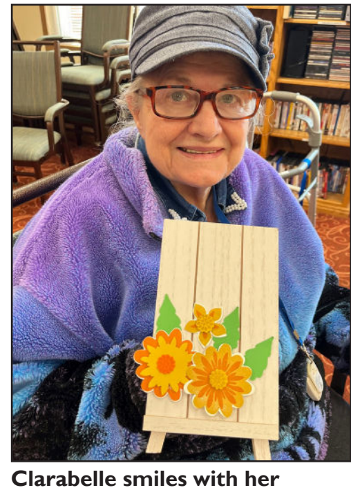
Clarabelle smiles with her finished masterpiece.