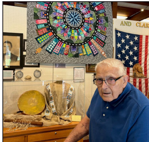
Don visits the Sarpy County Museum.