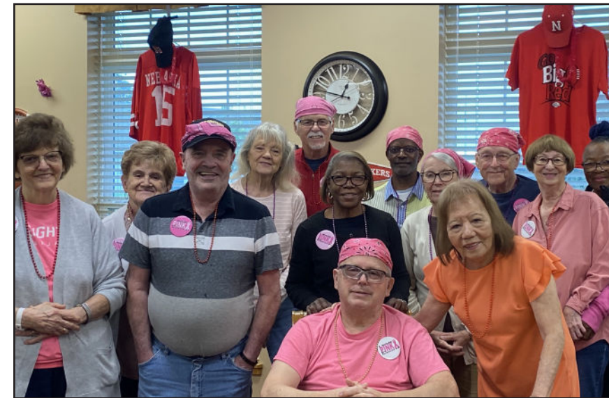
Club members dress in pink for breast cancer awareness.