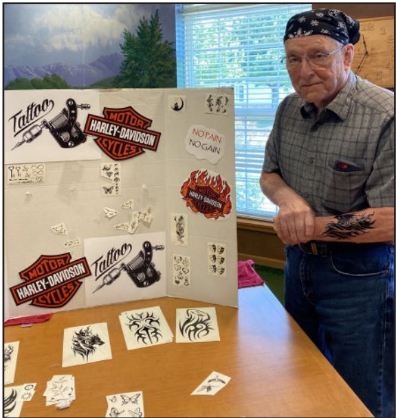
Woody visits the tattoo parlor.