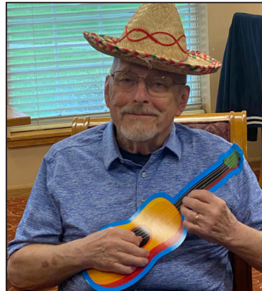
Woody says he can provide the entertainment next time.