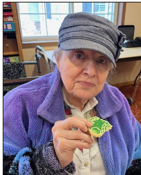
Clarabelle snacks on a cookie.