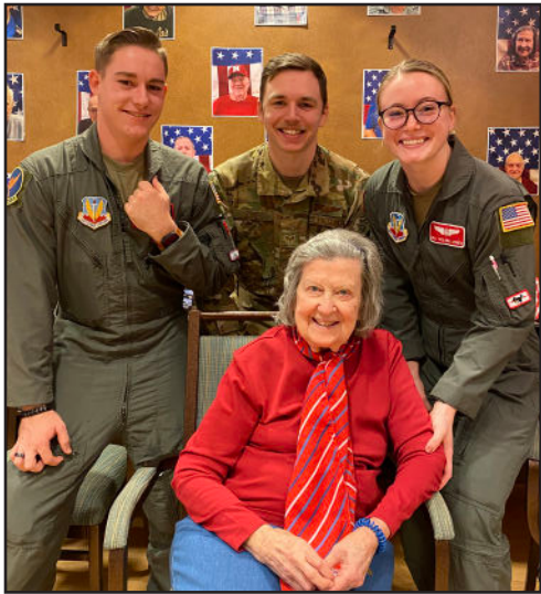
Annie poses for a photo with U.S. Air Force airmen.