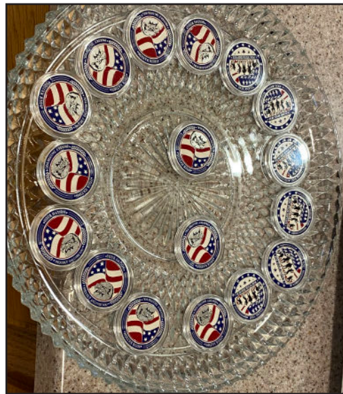
Veterans receive coins as part of the Veterans Day ceremony.