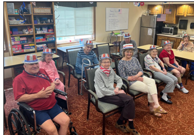
Red, white and blue hats are a popular style choice for a patriotic holiday.