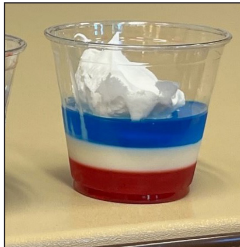
National Jell-O Day is celebrated with a sweet treat.