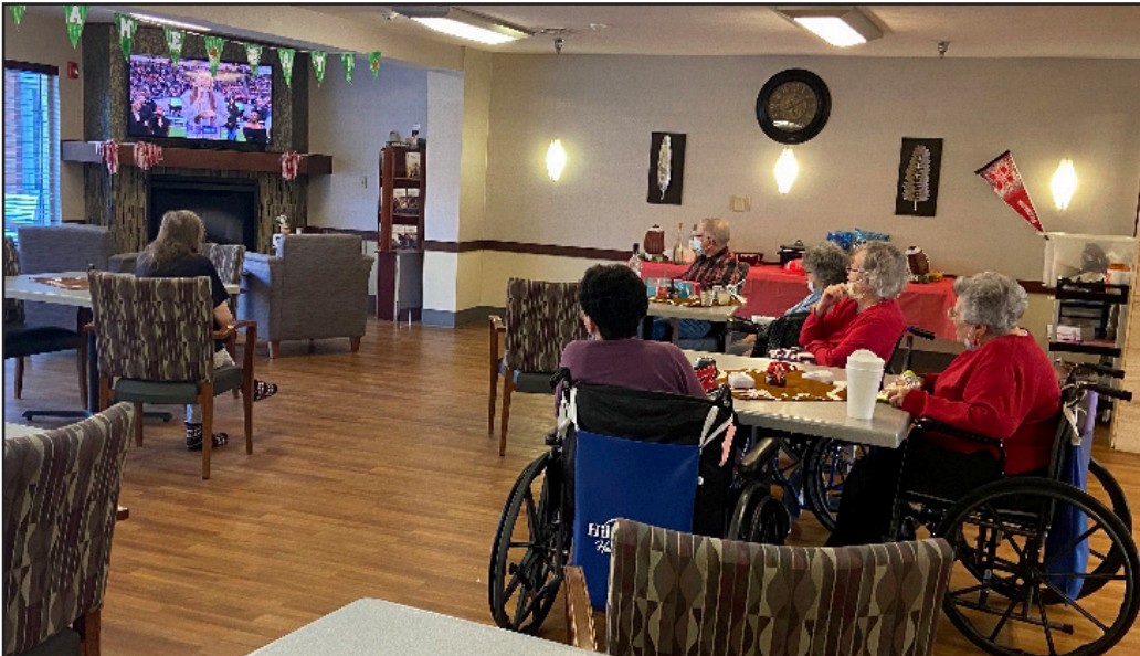
Residents watch the Super Bowl.

February was full of parties! We enjoyed getting together for the Super Bowl, Mardi Gras and Valentine's Day. All of those parties just so happened to be in the same week, so the rest of the month was mellow and peaceful. Residents participated in activities to appease their musical ears, move their