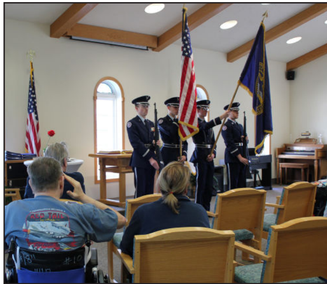
The Bellevue East Color Guard joins us as we honor Vietnam-era veterans at Hillcrest Health & Rehab.