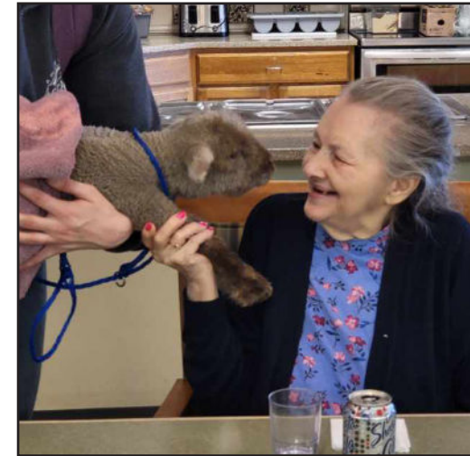
Connie wants to adopt Precious.