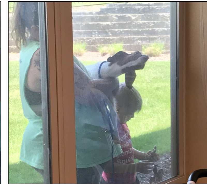
The goat from Scatter Joy Acres tries to get a better look at the residents.