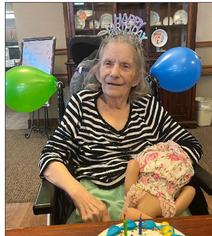
Bev W. celebrates her birthday with friends at Cottage 50.